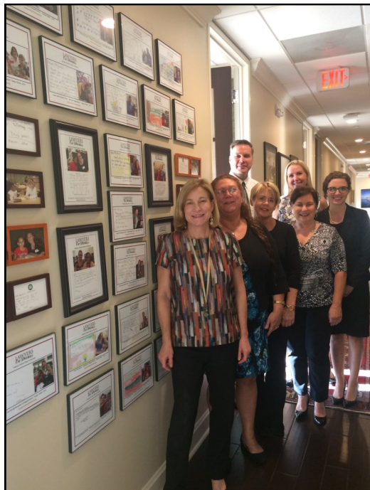
Harris & Hunt, P.A.

An office community service project with