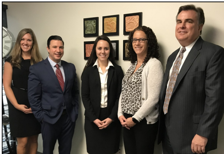
Legacy Protection Lawyers